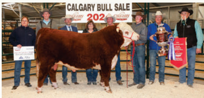
2024 Grand Champion: YV 84H FORTY CREEK 147K YV Ranch

292243 Wagon Wheel Road, Balzac, AB, T4A 0E2 • 403-516-3297