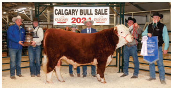
2024 Reserve Grand Champion: FE 85G ROYAL CLASSIC 203K Fenton Hereford Ranch